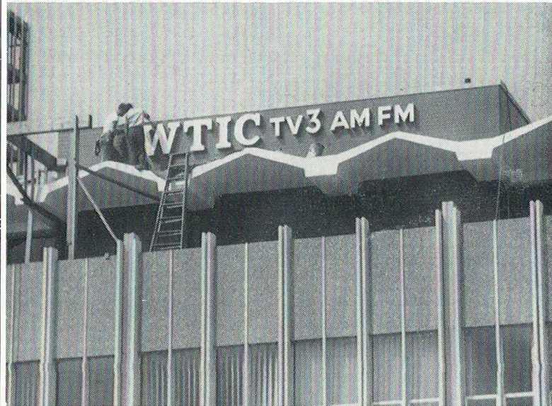
IT'S OFFICIAL. Latest exterior addition to Broadcast House in Constitution Plaza are the call letters and other station designations on the south side of the building. Just visible at the top left is a corner of the 100 Constitution Plaza building.